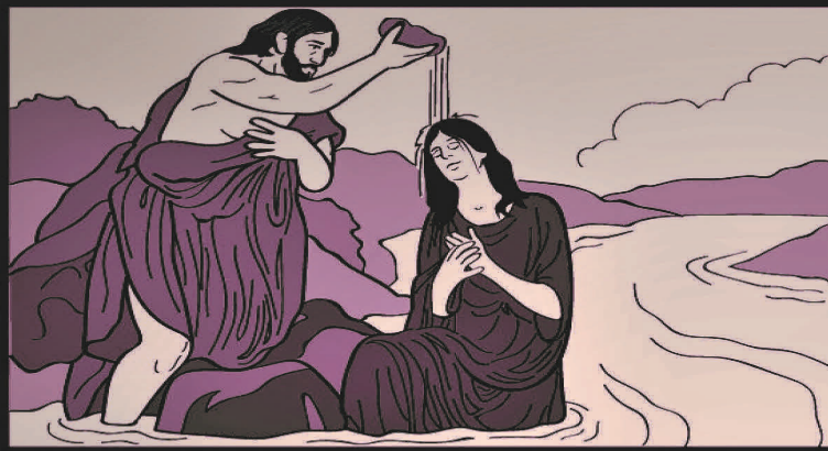
© 2018, J.S. Paluch Company, Inc.

NEW PARISHIONERS WELCOME - Registration forms online at www.lourdesvictoria.org or email: ollvic@lourdesvictoria.org